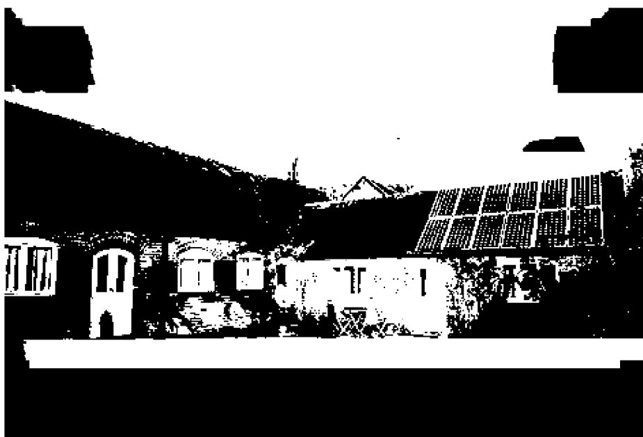
Figure 2. The actual result of the LLL practical application

Talking about the actual result of the LLL practical application in the western countries, we should note the case study of solar panels and improved insulation properties of the walls and roofs in the house which was reconstructed from the former stables ( fig. 2 ). The owners were deep retired husband and wife which were about 80 years old. Payback period of the project was approximately 10 years. When I asked them "Why did they do that?" they responded the following story. They wanted to know what they could do in their house. So they sought advice by e-mail to their energy company. Then the specialists came and made energy auditing of their house. They received its results and recommendations to the cost of the measures and their payback periods by e-mail two weeks later. There was also a heat pump and a boiler change among the measures. The pensioners chose the solar panels and heat insulation for the walls and ceiling from a proposed list.