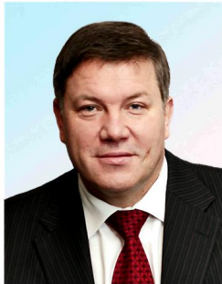
Oleg A. KUVSHINNIKOV Vologda Oblast Governor