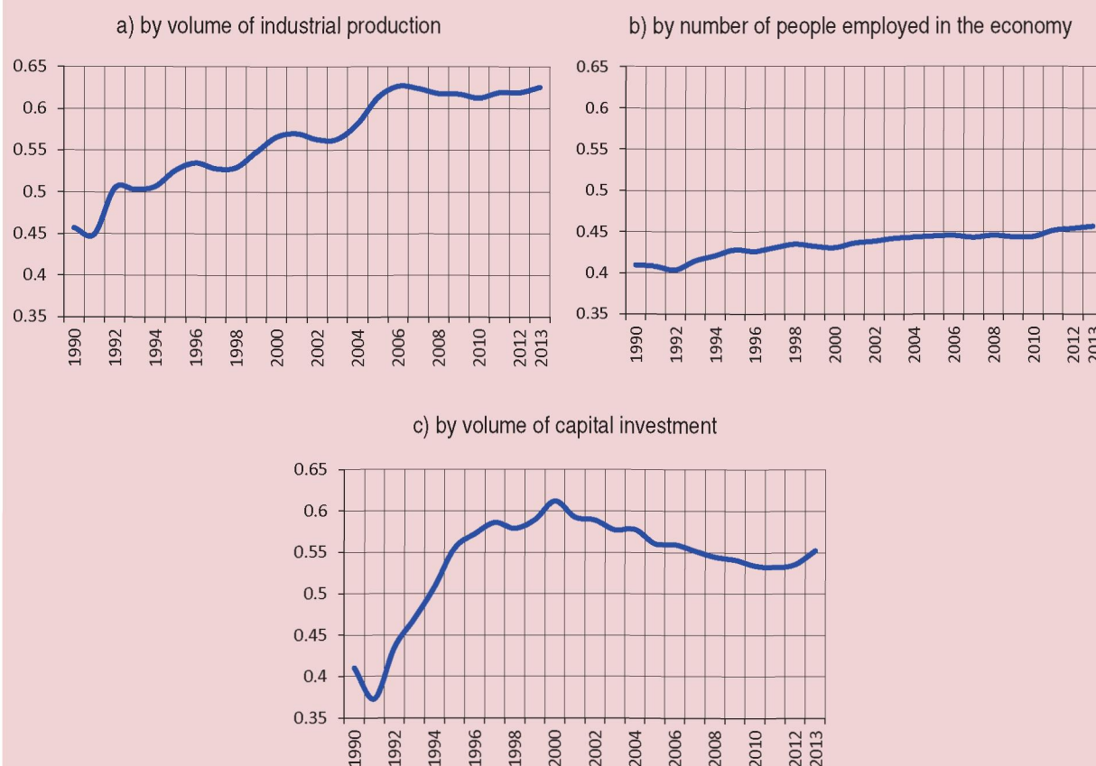
Figure 1. Dynamics of the Gini index in Russian regions in 1990–2013

Possible oversaturation of the region, which leads to the dispersion of economic activity, is the third reason for careful study of agglomeration processes.