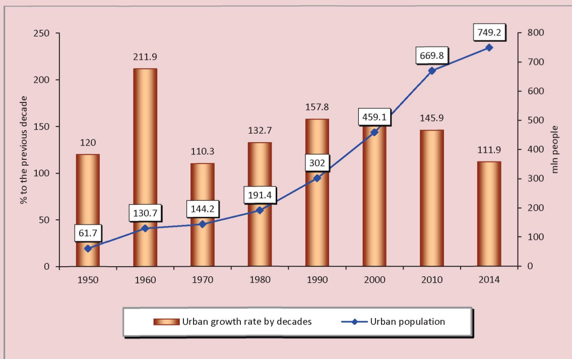
Figure 2. Dynamics of China’s urban population in 1950–2014

Compiled on the basis of the following source: China Statistical Yearbook 2015. Official website of National Bureau of Statistics of China. Available at: http://www.stats.gov.cn/tjsj/ndsj/2015/indexeh.htm .